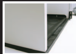
Durable modular base slides easily and supports door in all directions.