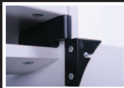
180 Degree nylon hinge for unobstructed collection