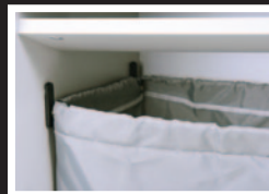
Nylon bag hooks makes bag fit tight. No paper misses the bag.