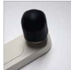
Soft-Touch Ergo Grip