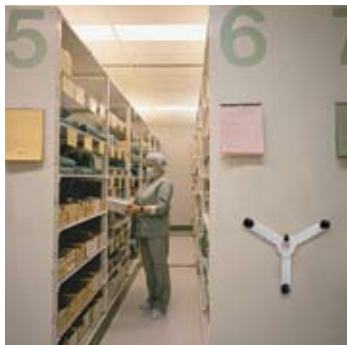
Laval University Hospital Center