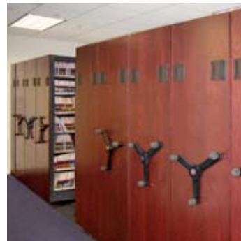
US Department of Homeland Security