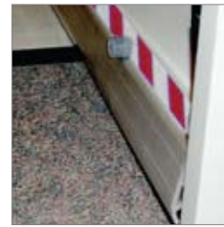
Mechanical Safety Brake

Please refer to www.montel.com for additional information.