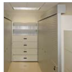
Lockable Rolling Shutter Doors