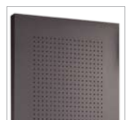
Perforated Panel (detail)