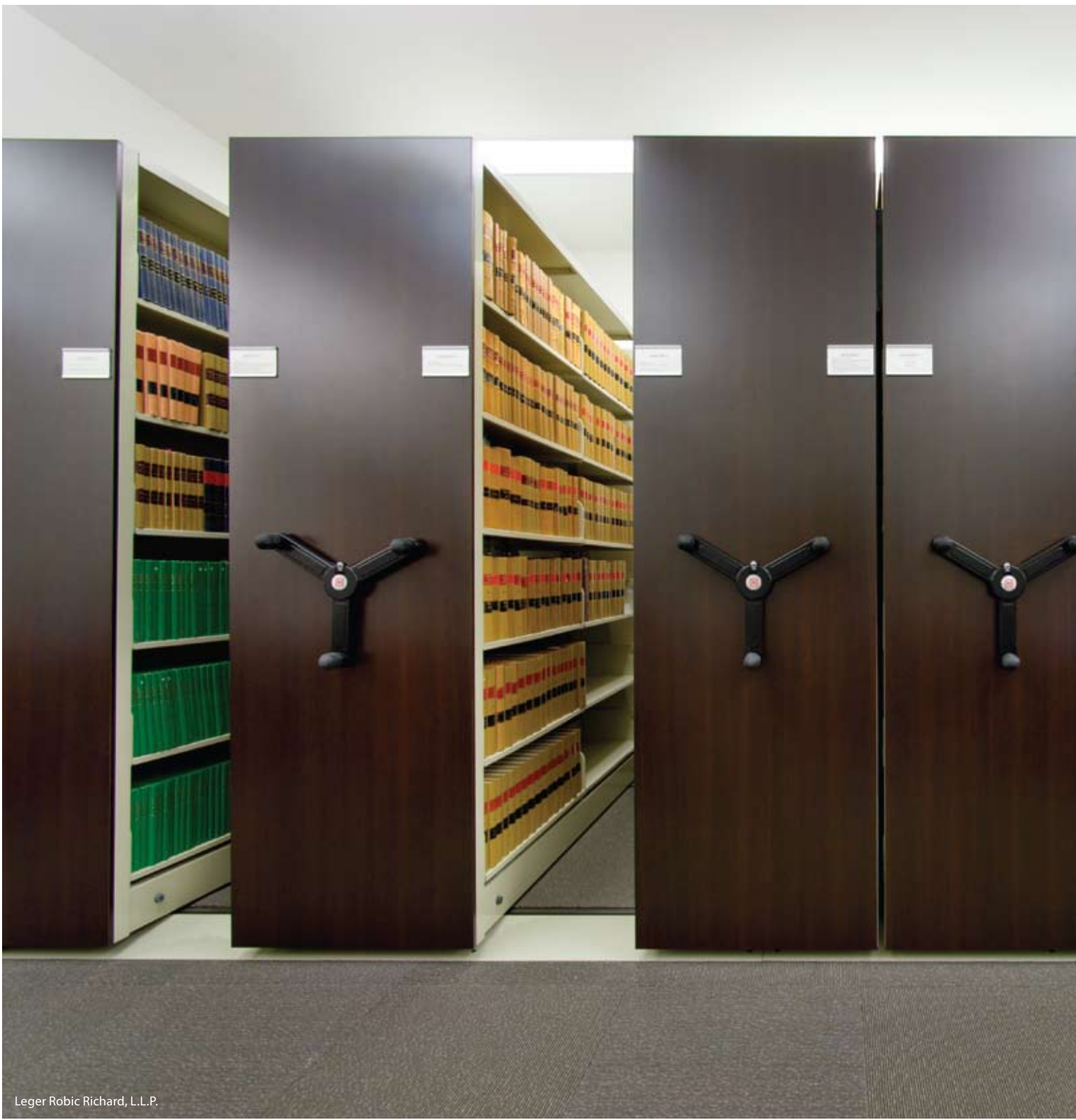
Leger Robic Richard, L.L.P.