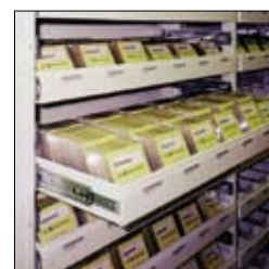
Pull-Out Media Drawers