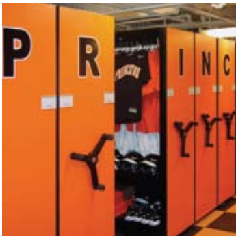
Princeton University Athletic Department