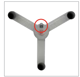
Handle with Locking Pin